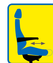
Seat Depth- setting