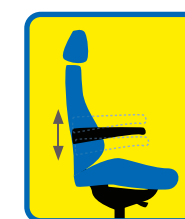
Armrest with height adjustment