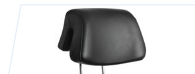
6-way comfort headrest