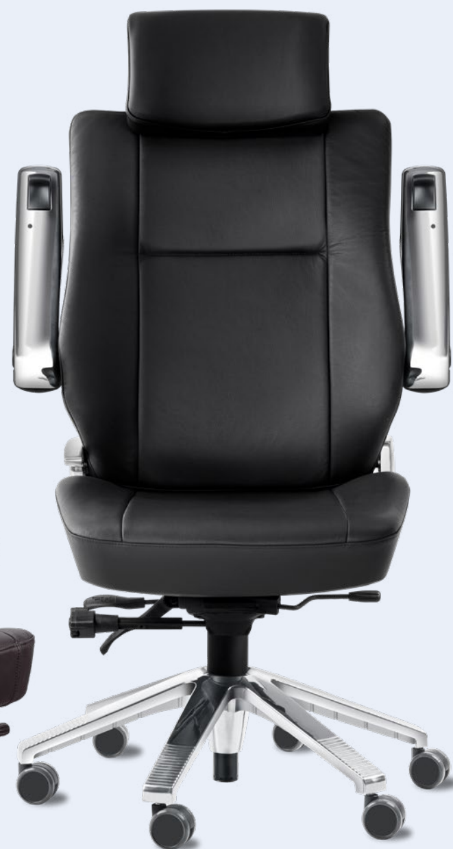
Office X6 in Leather