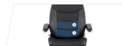
Lumbar support pneumatic