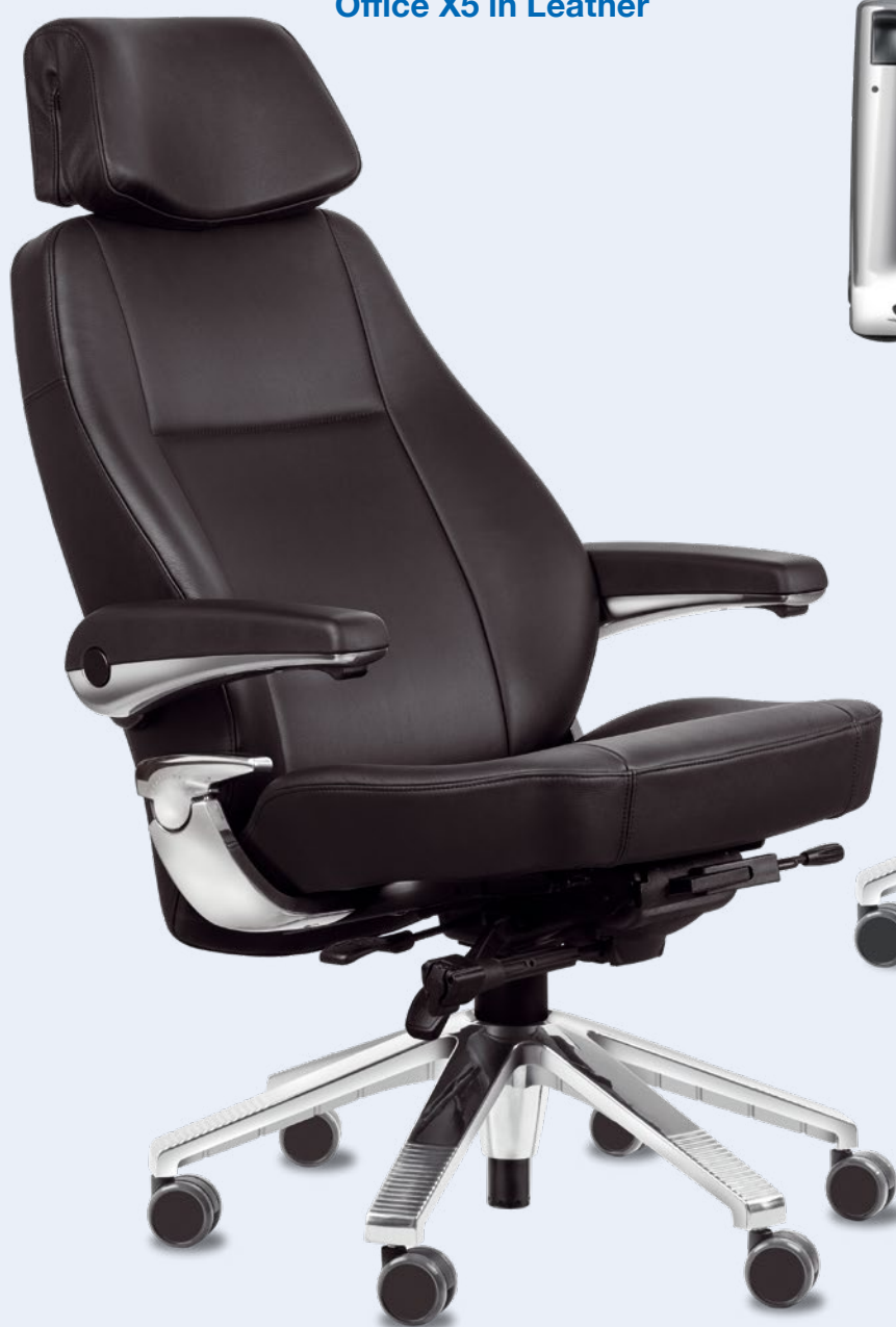
Office X5 in Leather