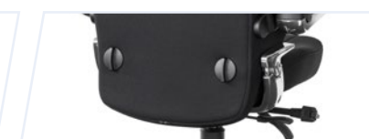
Lumbar support mechanical