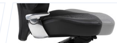
Seat depth adjustment